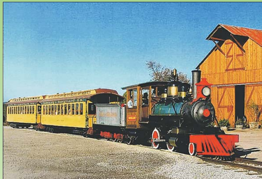
The first-ever Central Coast Railroad Festival is Oct. 8 to 12. Events and activities will be held at rail-related locations throughout the county. Details: (805) 773-4173, ccrrf.com .

Coming up The 28th Annual Morro Bay Harbor Festival takes place during the weekend of Oct. 3 and 4 . There will be three stages of musical entertainment, wine tasting, kids activities and