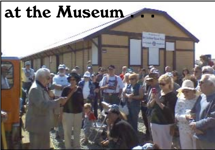
On October 10, 2009, San Luis Obispo Mayor Dave Romero reads a proclamation dedicating the Museum display track prior to driving the Golden Spike to finish the job.