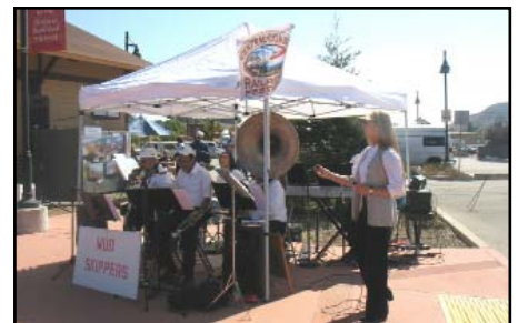
The Mud Skippers provided the music.